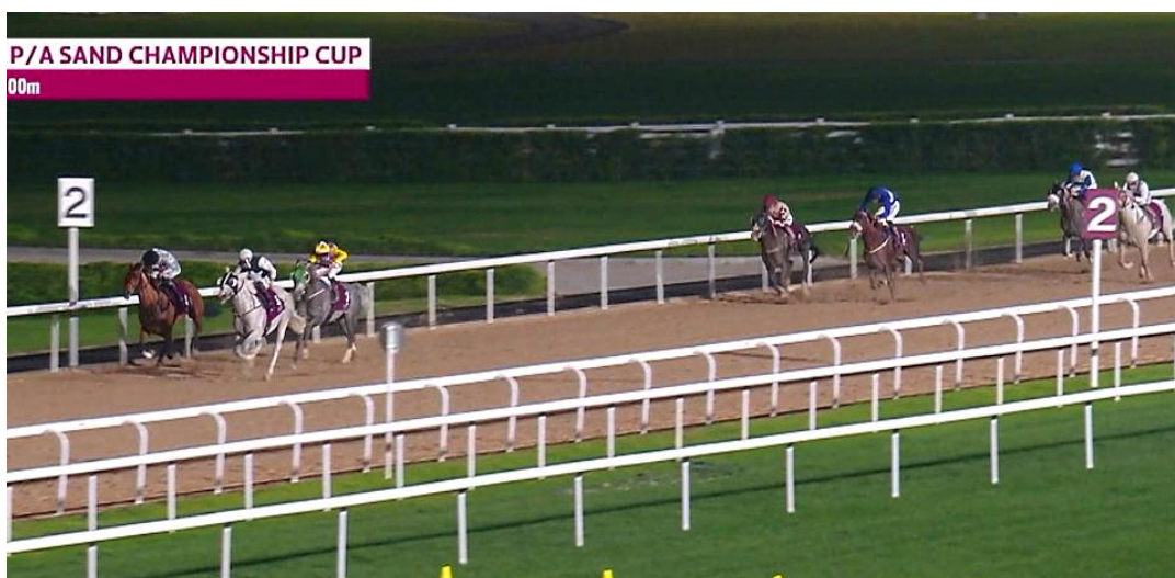
Photo: KAMUN DU NIL along the rails at the 200m mark.