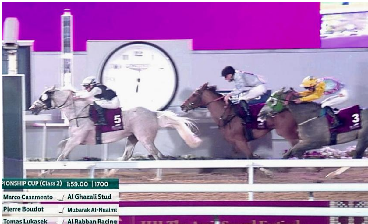
Photo: Finish with MARED AL JASRA in front of KAMUN DU NIL and BURKAN.