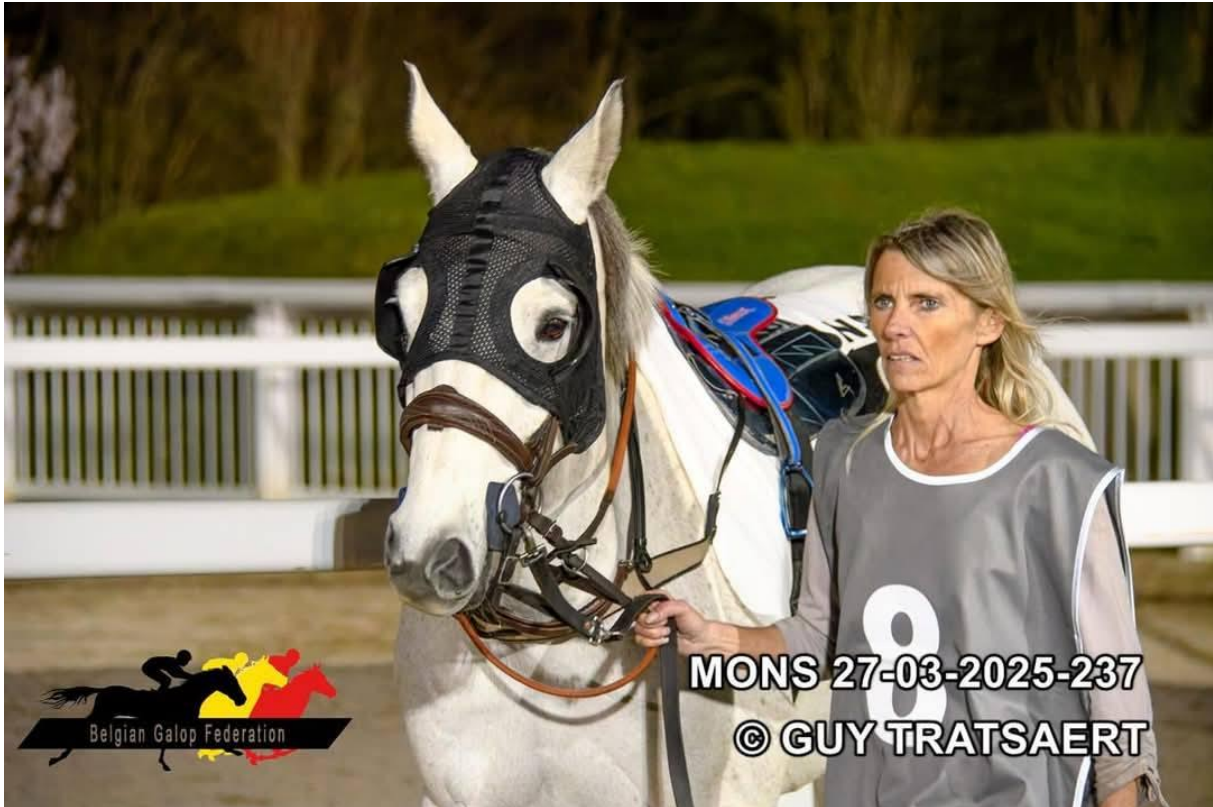
Photo: NIL ADAMIS, 2017 (Damis x Nil Abiat by Darike) at the presentation ring in Mons.