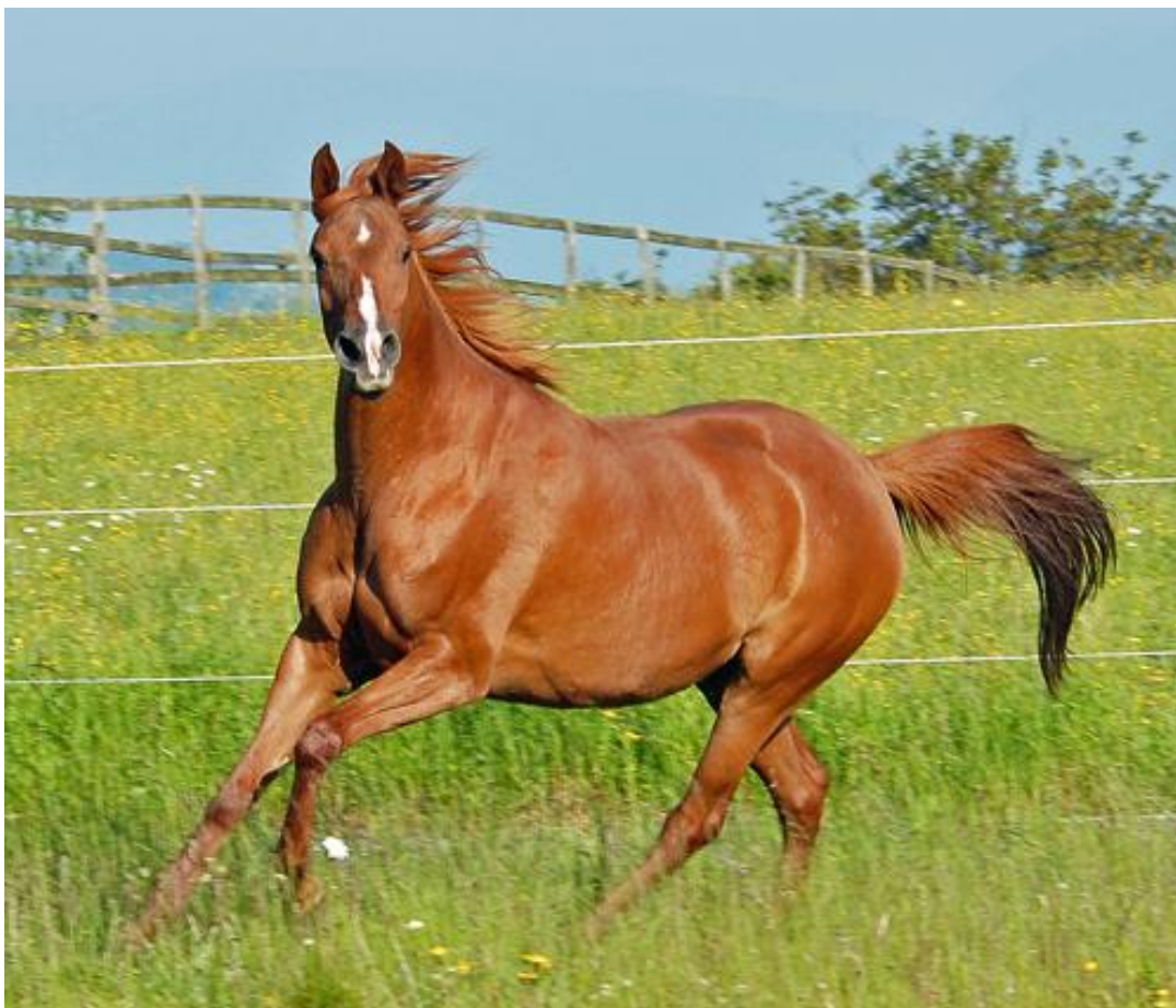
Photo: our Tunisian bred foundation mare KAHLOUCHA, 1998, black type horse with five wins and successful broodmare. Here pictured as a young mare at our former Stud in Switzerland.