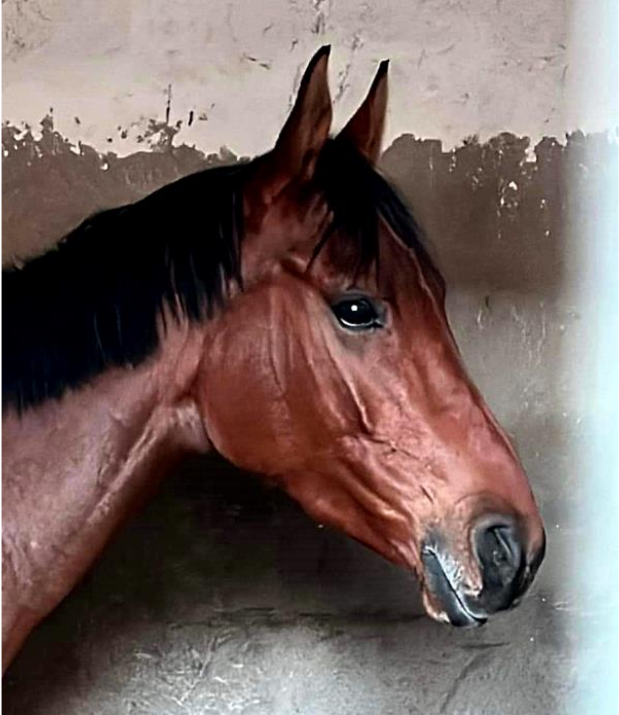
Photo: KAMUN DU NIL shortly before his race in his box in Toulouse