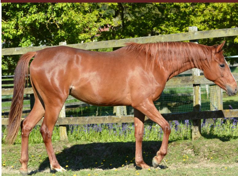
left: NIL ALAMOON , 2012 (Nil Bedouin x Nil Anablue) with two years.

The chestnut color comes from her grandfather MUNJIZ . MUNJIZ , as well as his father KESBEROY and his mother UNCHAINEDD MELODY have been chestnuts.