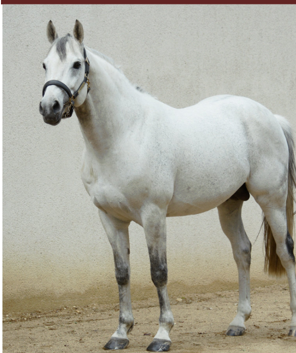
Above left: Outcross producer GENERAL , 2005 (Amer x Al Hanoof) on the A-line. He brings from his sire's side the blood of Saudi Arabian stallion AMER and from his mother's side over his grand dam PESENNAIA (Naftalin x Pesnia) the Russian dam line of TAKTIKA in the A-line.

The four times group I and double Arc de Triomphe Arabian World Cup winner has a win sum of over 1 Mio €. From 15 starts, he won 10 times, was 2 times second and 3 times third. He is available for breeding for proven mares for € 6'000.--. His first crop is the yearlings of 2014.