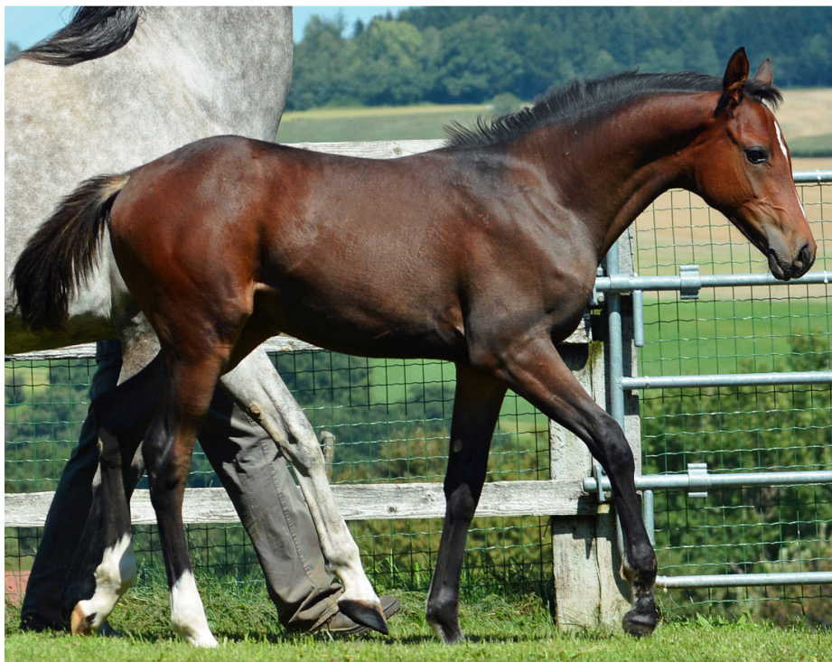
left: NIL ADMIRAL , 2014 (General x Nil Anablue by Munjiz) with three and a half months.

The second foal of NIL ANABLUE is the youngest representative of our A-line. It is the 2014 born colt NIL ADMIRAL by GENERAL and he is the second generation of that sire.