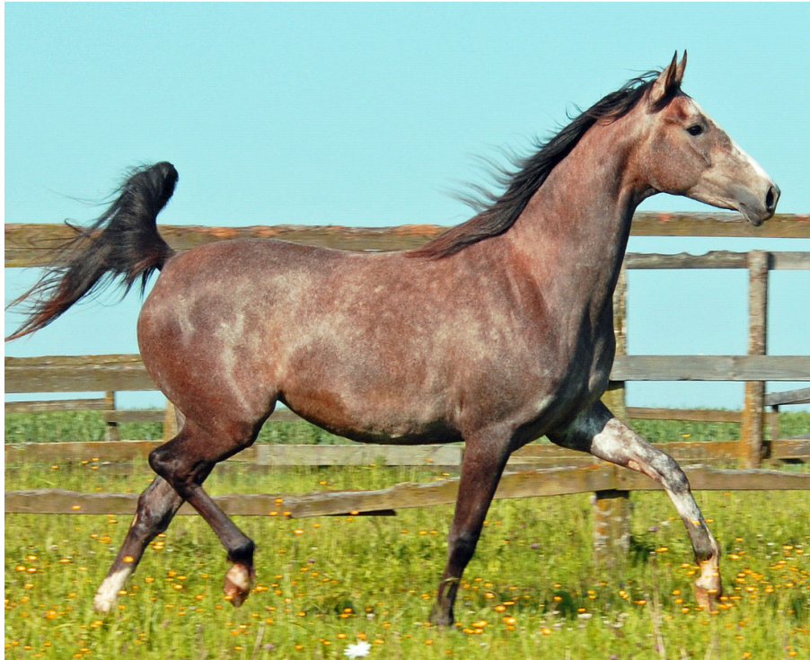
left: NIL ANABLUE , at the age of 2 years on the stud farm of Nile Arabians in Brenles.

racers, 7 group II and 8 group III races. She still holds the track record in Abu Dhabi over the mile and over 2000m as well as the track record in Dubai over 2200m.